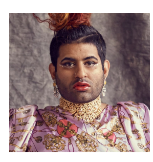
ALOK (they/them) Author, performer, & media personality